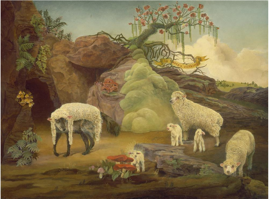
The Wolf in Sheep's Clothing. (2009). Ellen Tanner (b. 1975). Oil on panel