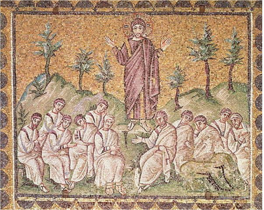
The Sermon on the Mount, Byzantine School, 6 th century