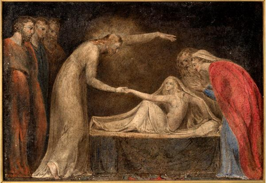
Christ Raising Jarius's Daughter , object 1 (Butlin 417). (c. 1799). William Blake (1757-1827). Tempera on canvas.