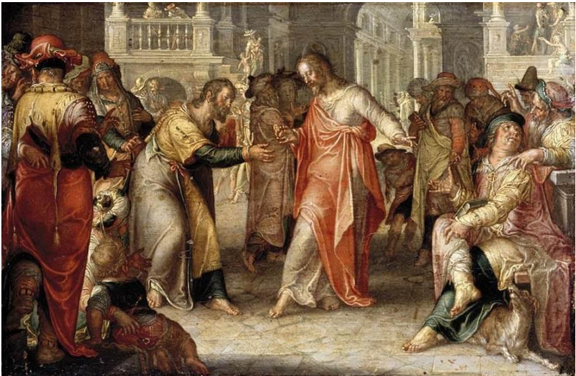
The Tribute Money. (1616). Joachim Wtewael (1566-1638). Oil on copper.