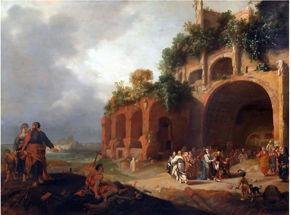
Jésus guérissant un sourd-muet/Jesus healing a deaf-mute. (1635). Bartholomeus Breenbergh (1598 – 1657). Oil on panel