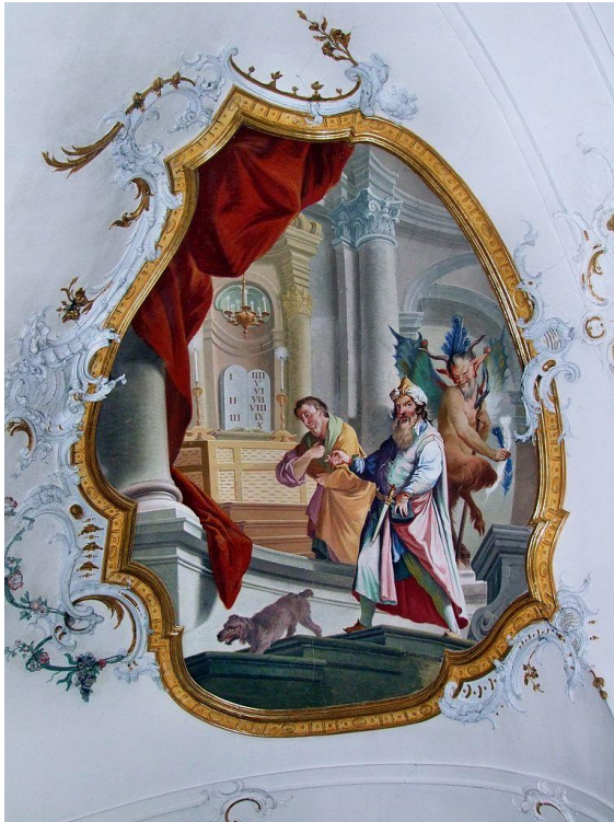
Pharisäer und Zöllner [The Pharisee and the Publican]. Ign. Fresco in the Ottobeuren Basilica.