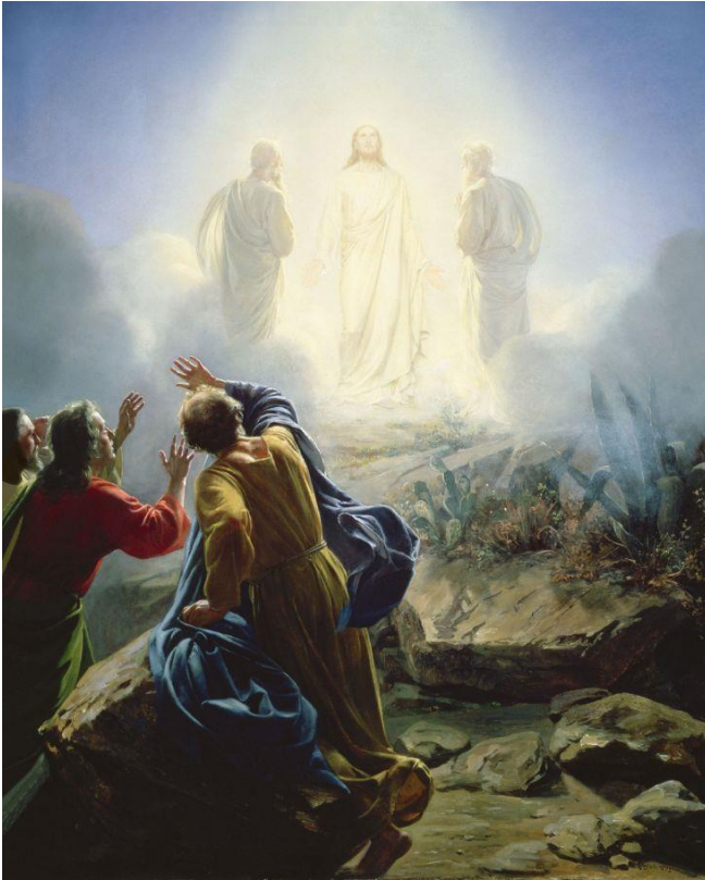
Transfiguration. (1865 - 1879). Carl Heinrich Bloch (1834 - 1890). Oil on canvas.