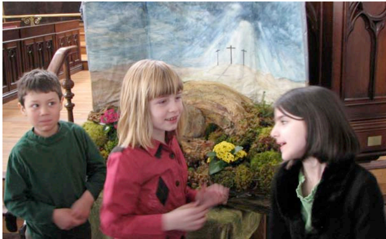
Good Friday 2007