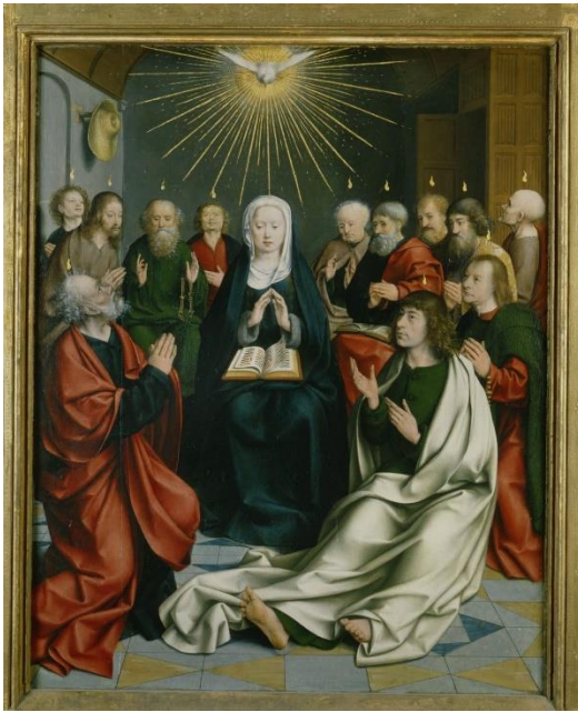
Pentecost (Pfingsten) , Jan Joest van Kalkar, 1505-1508