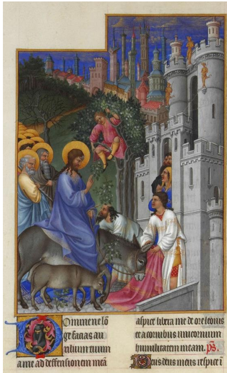
The Entry into Jerusalem (Les Très Riches Heures du duc de Berry, Folio 34v) (1412-1416). The Brothers Limbourg (fl. 1385-1416). Miniature