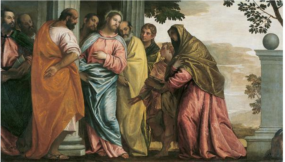
The meeting of Christ with the wife and sons of Zebedee (c. 1565). Paolo Veronese (1528-1588). Oil on canvas