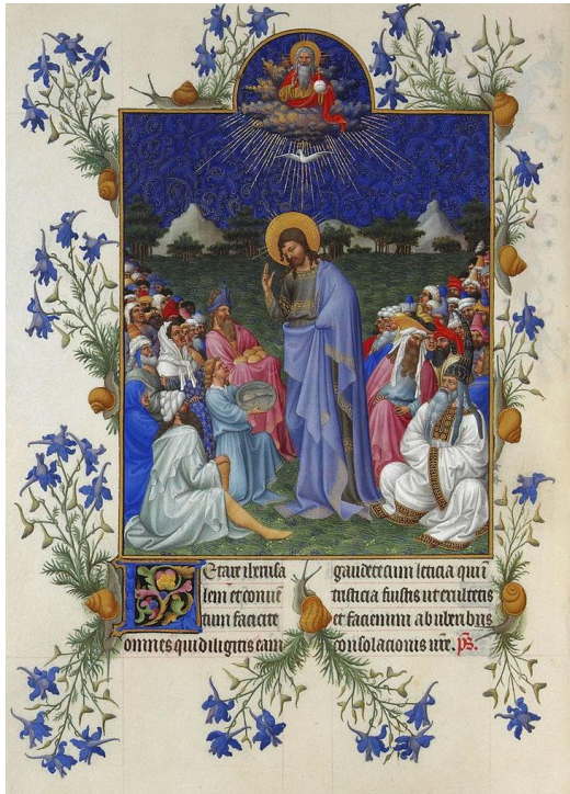
The Feeding of the Multitude. (1411-1416). The Brothers Limbourg (1794-1872). Tempera on vellum.