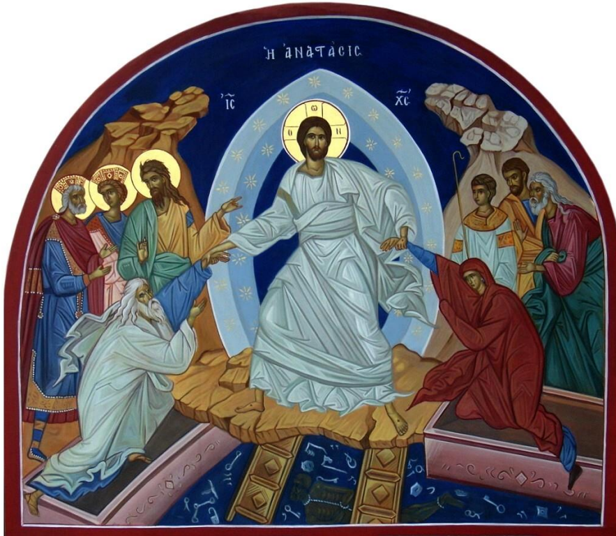
Icon of Christ's Descent into Hades and the Resurrection