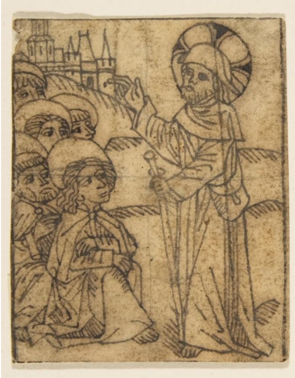
Christ taking leave of His disciples. (15 th c.). Ign. Pen and ink.