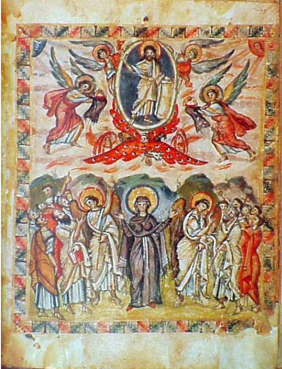
The Ascension. (6 th c.). Miniature in the Rabbula Gospels (folio 13v)