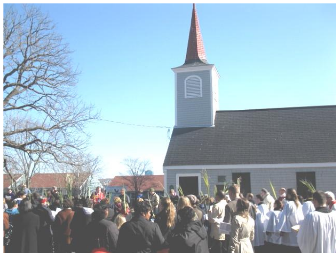
The Little Dutch Church features in our 2012 Palm Sunday procession around the neighbourhood.

This year, I was particularly excited to have been able to re-write the brief Parish History that is now available to visitors and parishioners alike. This is the first time that the History has been rewritten and updated in booklet form for over 50 years, and I hope that many will discover and enjoy the church's rich history through this medium. In addition to this project, I led tours of the Round Church and Little Dutch Church and we had over 100 visitors – some from as far away as Australia! St Patrick's Roman Catholic Church (across the street) also began offering historic tours last summer. Their organizers were quite impressed with St George's rich history as well as our number of visitors. Hopefully, we can use these ties to expand public awareness of both churches in the future.