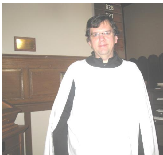
Our fine music director in uniform. Don't be fooled, this photo does not reflect his cheery disposition.

As I reflect on my first full year as Director of Music, I realize that most of my week is spent singing, rehearsing choirs or giving singing lessons. What a privilege it is! Whether it is the cherubs bouncing around the Guild Room singing 'Jumping for God', a glorious polyphonic Kyrie on a Sunday morning, or the Junior Choir warming up on 'Jubilate Deo' by Praetorius, my work is richly diverse and exciting. Ours is truly a singing Parish, as may be attested by the lusty rendering of hymns and psalms at divine worship. Hildegard's image of the divinely inspired breath suggests to me that the art of singing itself can become a spiritual practice. The discipline of focusing the breath and refining the sound