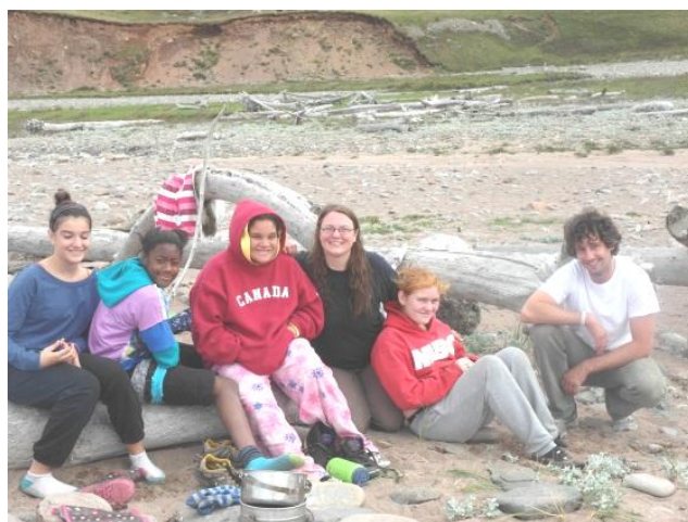
Hanging out at Pollett's Cove, Cape Breton

The highlights of the year came as a result of two one-time grants that allowed YouthNet to expand its wilderness program into the spring and fall and to add a much-needed teen program in September on Tuesdays. This year we did hikes at Cape Split and McNabs Island, two five-night trips at Cape Chignecto, and a trip to Pollett's Cove. These trips allow for the growth of the relationships between youth and staff, which is significant, and contribute to the success of the mentoring relationships staff are able to build with youth, making these trips one of the single most important things YouthNet does. Moreover, the importance of these wilderness trips to the development of the youth themselves cannot be overstated as their impact on participants is long-lasting. For some, the trip is an incredible physical challenge, but all feel a huge sense of accomplishment and personal achievement. These trips encouraged participants to expand their sense of identity as they overcame physical and mental challenges, and pushed them beyond what they thought was possible. These successes build self-esteem, giving them confidence to face new challenges and to try new things, which staff and volunteers see in other aspects of programming.