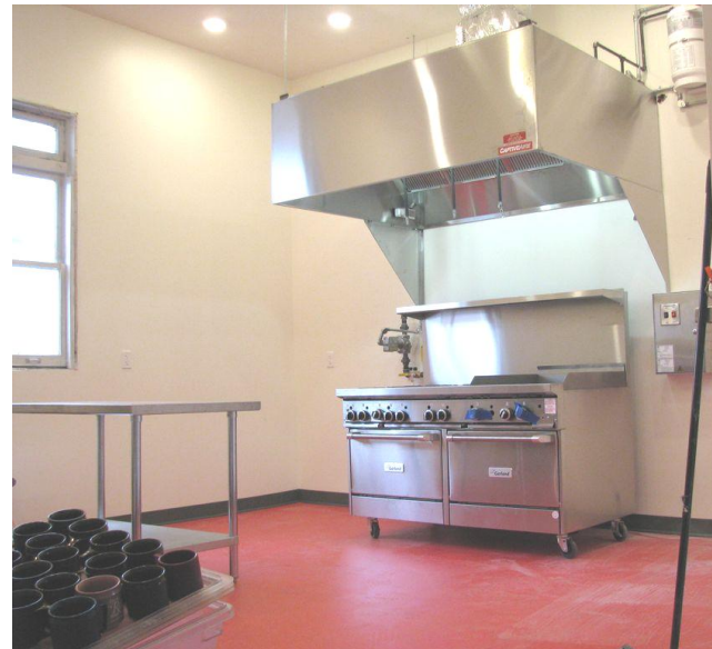
The new stove, installed the final week of February, 2013.

One of the major undertakings of this part year has been the beginning of phase 2 of the hall repairs and renewal. The hall is both a focus for ministry in the neighbourhood, and a venue for many of the events and activities which are part of the building up of the body of Christ in this parish. Bringing this project to completion will require dedication and sacrifice. It will only be possible if the burden is shared by the parish as a whole. There are lots of practical reasons why making the hall more functional, efficient, safe, and attractive is a good idea. However, it will also be important for us to be guided by an understanding of how this project expresses the inner and spiritual life of the parish and offers new possibilities for ministry. For example, a group of parents in the parish have been considering for some time how it might be possible to start a parochial school at St George's. Such a school would offer new opportunities for bringing together education and spiritual formation and for furthering the mission of the parish. Such a new beginning would also be an expression of hope and trust in the capacity of the Gospel to prepare young people to live faithfully and wisely amid the challenges of life today. This is just one example of the kind of ministries a refurbished hall could help to make possible.