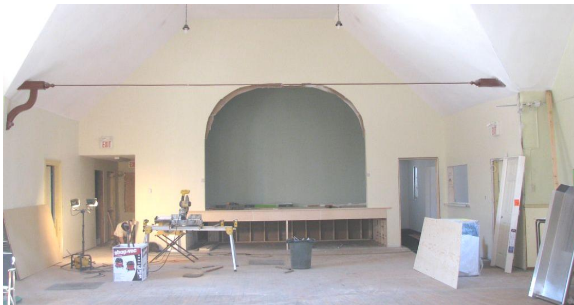
The hall transformed into a construction zone as work was done on the storage area, stage, and kitchen.