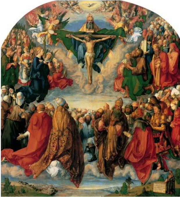
Adoration of the Trinity. (1509-1511). Albrecht Dürer (1471 – 1528). Oil on poplar panel